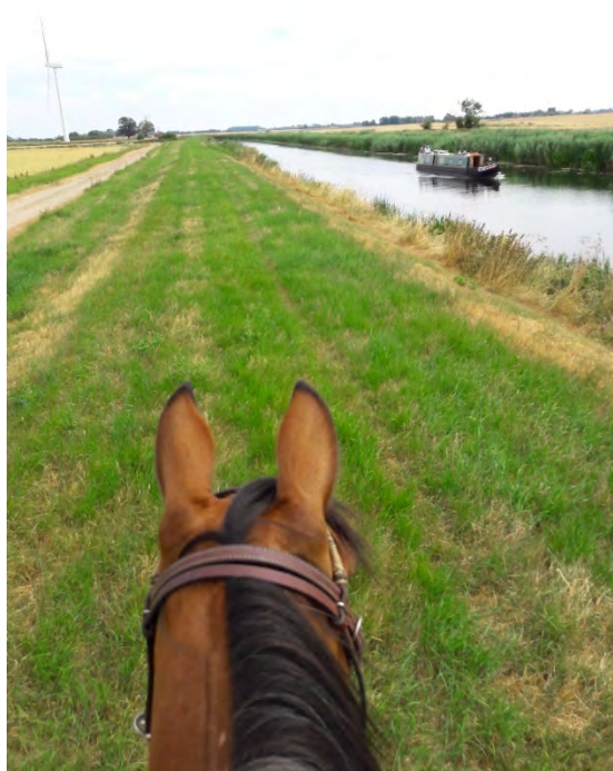
Watching the passing narrowboat in the shadow of the iconic turbines was an experience not to be missed and one of the more unusual trail experiences for Area 10.