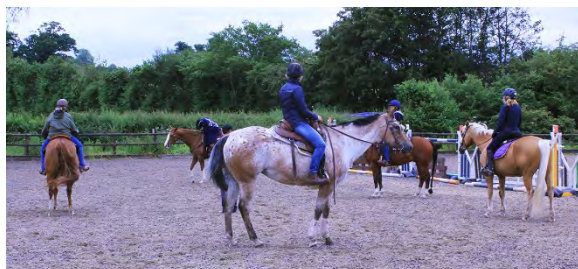
Contestants relaxing before the start of their class.