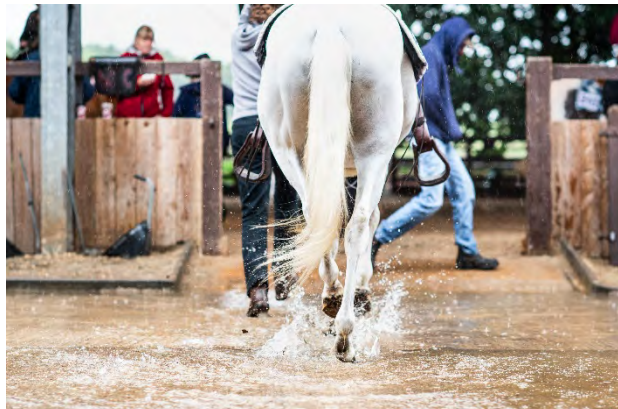
Rain Rain go away