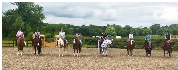
Spot the cow in the line up!!