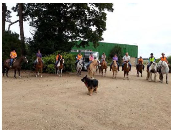
BBQ Ride line up before setting off across the Fens and heading back to the Deptfords' awesome barbecue.

The National Show will have taken place by the time you read this and we are hoping for a good turnout from Area 10 members as there is a lot of hard work and energy put in to making this the climax of the WES calendar. Good luck to all competing.