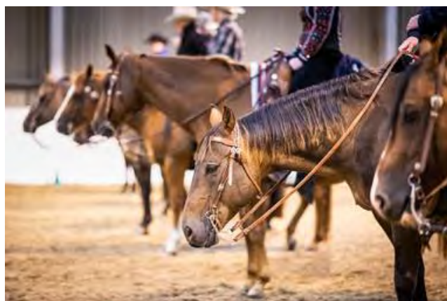
Features Phillipa Dempsey's horse head down