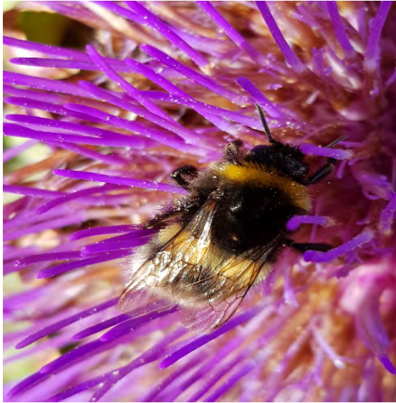
Smell the flowers, step back and move on.

So I moved on, I have two lovely young mares and I bought a nice (just backed English, highland gelding) I do like a challenge! I am at a nice yard with nice people and I can let down and breathe. But.. I need to remember when we ask our horses for these changes and get cross when they don't "get it" think about this year step back a bit and breathe, think why may be we need to present it in a different way a bit like 2020 being presented to us!