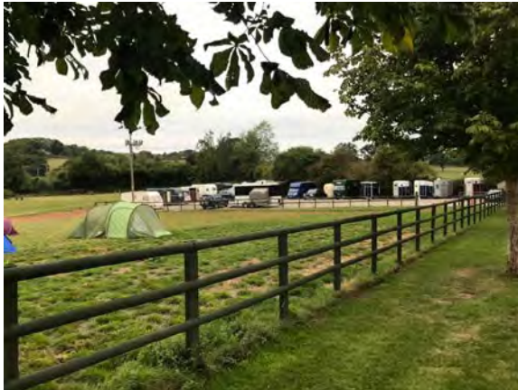
The carpark and camping field