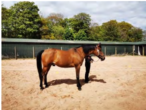
Phylis Drummond - Showmanship Photo show Champion