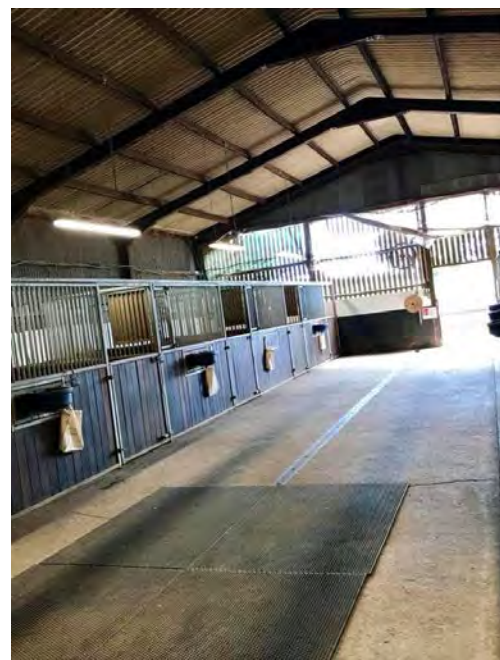
The training barn