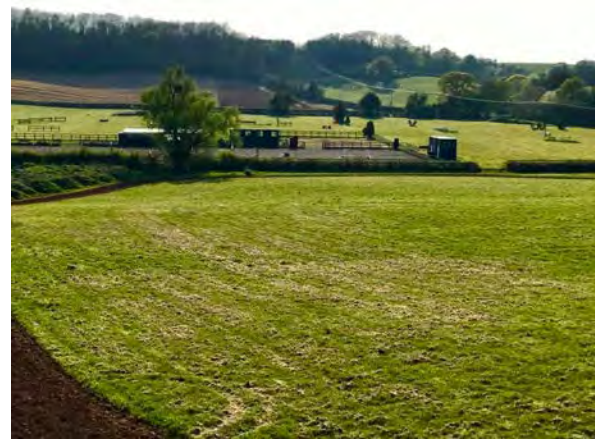
The cross-country course and part of the arena