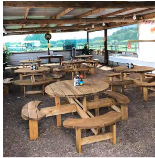
The saloon tables