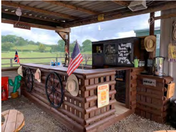
The saloon bar