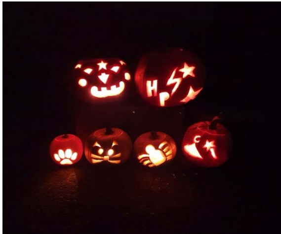
Nancy cooks winning Pumpkin Carving