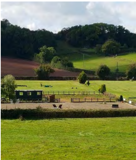
The cross-country course and part of the arena