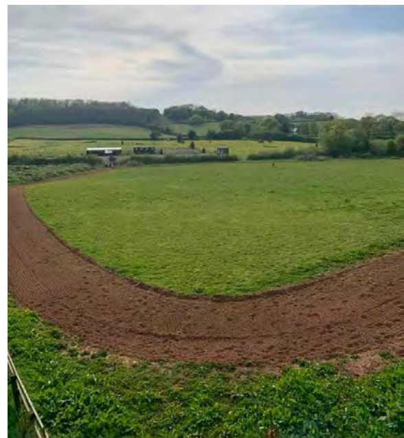
The Canter track