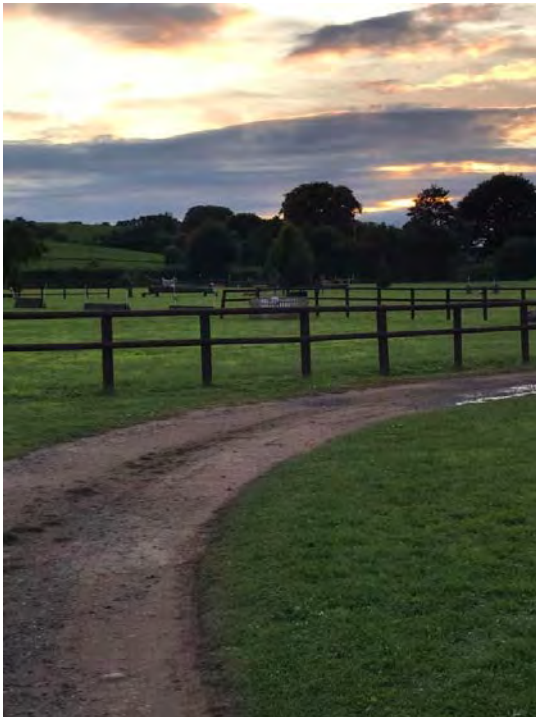
Part of the cross-country course