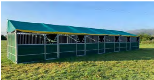
Some of the temporary stables