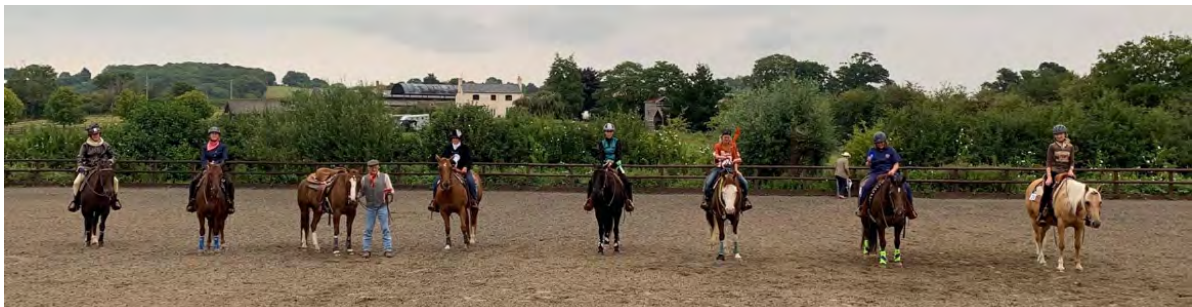
The Freestyle Reiners

We had one class of Freestyle Reining on Saturday evening and the main show on Sunday. Who knew we had so many Freestyle reiners in Area 6.....We had 8 entries in freestyle reining! It was a really fun evening with a great atmosphere and a variety of music ranging from Black Beauty, to disco, to The Beastie Boys and pretty much everything in between.