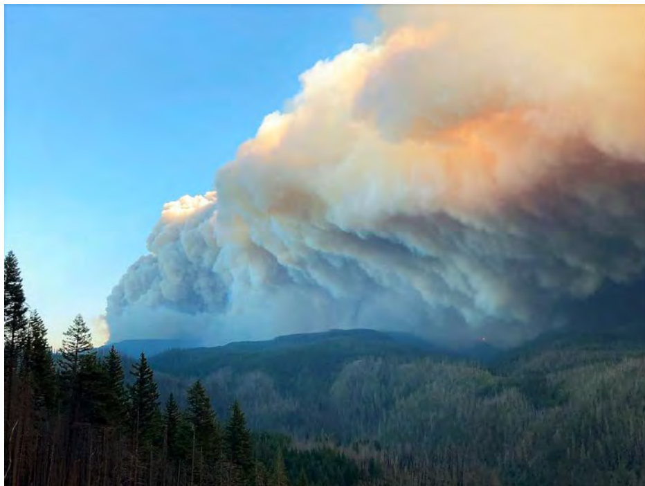
Sun catching the smoke from the McKenzie River fire