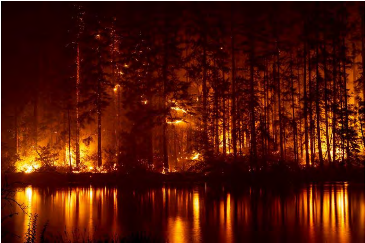
Imagine seeing this across the river from your house/yard. This is the McKenzie River Fire burning east of Eugene on the shores of the McKenzie River near the Leaburg Dam.