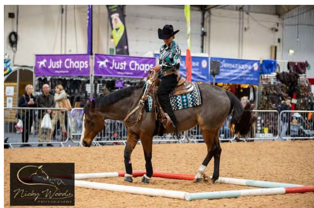
Look no bridle!!