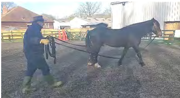
The Editor long reining his stallion Brego using Alex’ methods. The offside rein is actually sitting across his withers

+R trainers use a ‘marker’ or ‘bridge’ signal to mark the exact moment when the animal has displayed the desired behaviour so that they can then follow up with a reinforcer such as food or scratches. This signal means that we do not have to feed the animal the second they display the desired behaviour because the marker signal tells the animal: “Yes! That was correct – your reward is coming”.