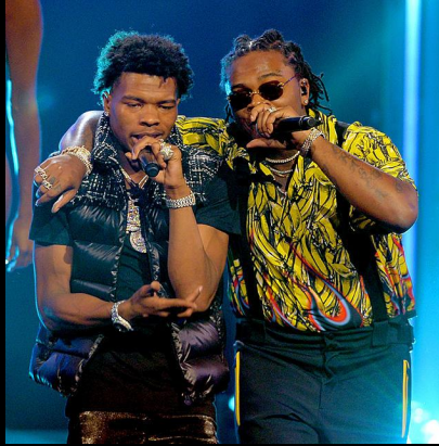
Thursday March 17 Gunna Young Thug