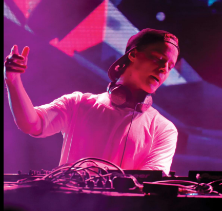
Friday March 18 Kygo