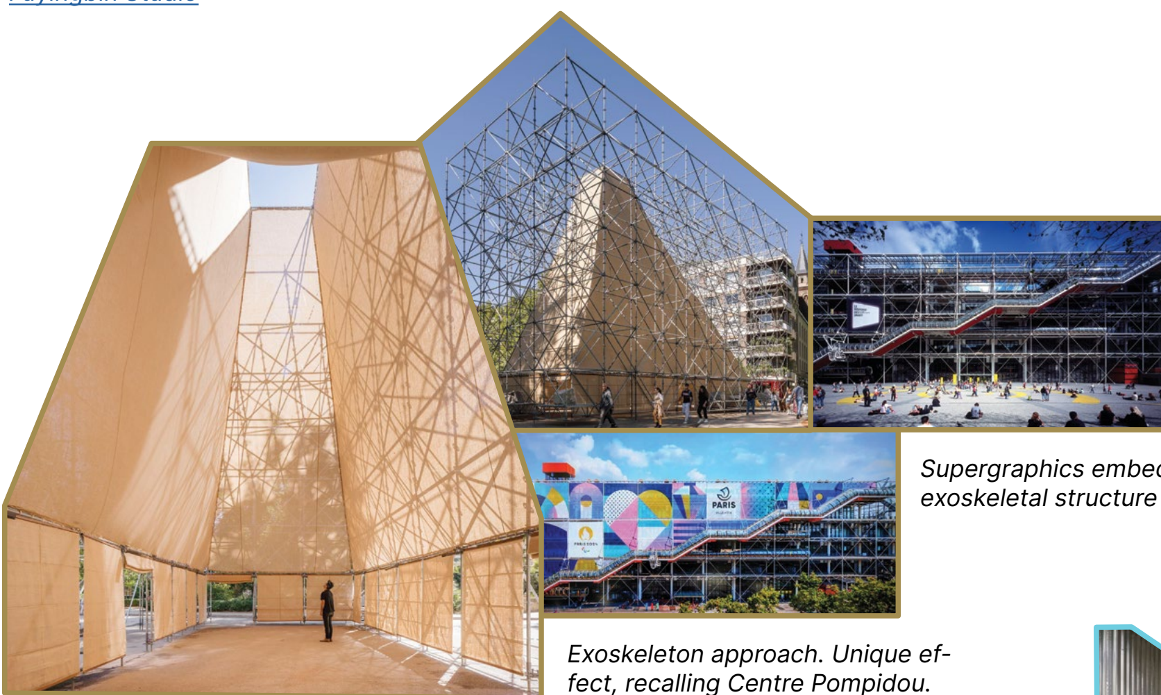
Supergraphics embedded into the exoskeletal structure is nice...