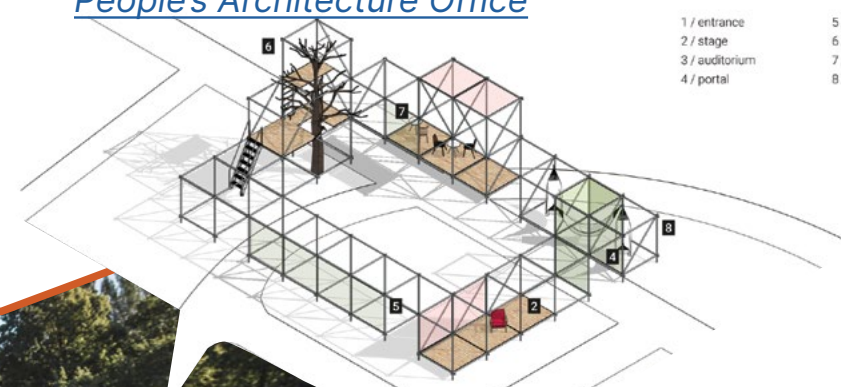
Simple, cubic structure, used to great effect. A systematic approach with a vocabulary of elements.

Very nice effect with raised entry way and and scaffolded tree well.