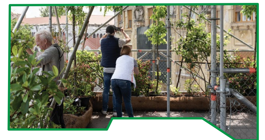
Simple raised bedding for nursery.