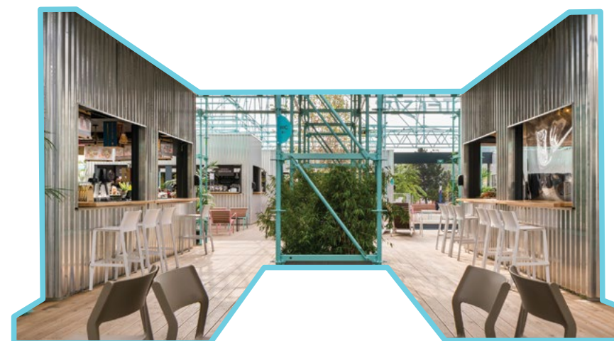
Large barn door or similarly large, transformative structural element.