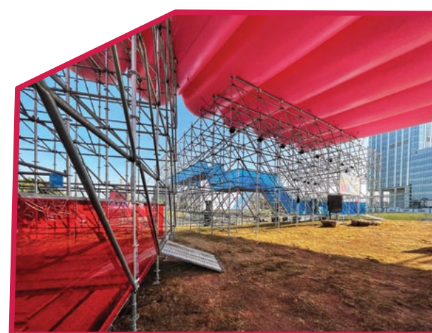
Wild, inflatable roofing