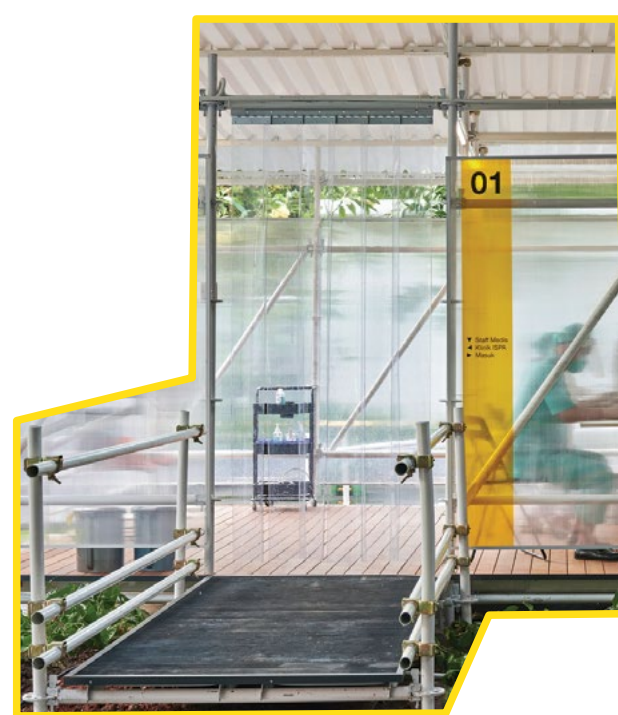
Large wayfinding and graphic components as well as paneling achieve a polish.