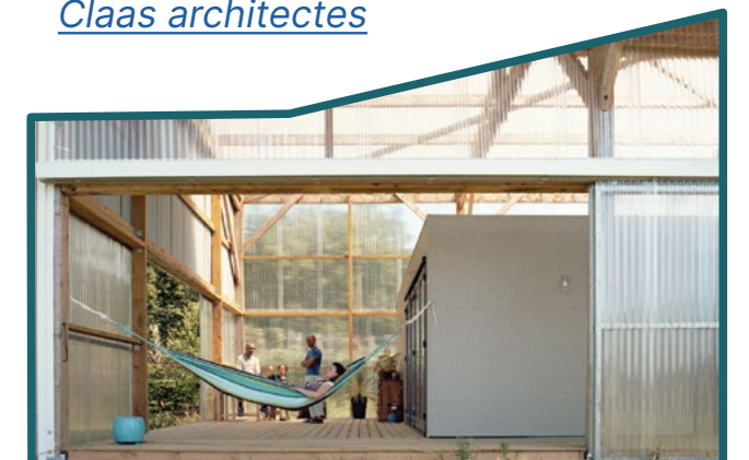
Draped roof, from inner to outer structure.