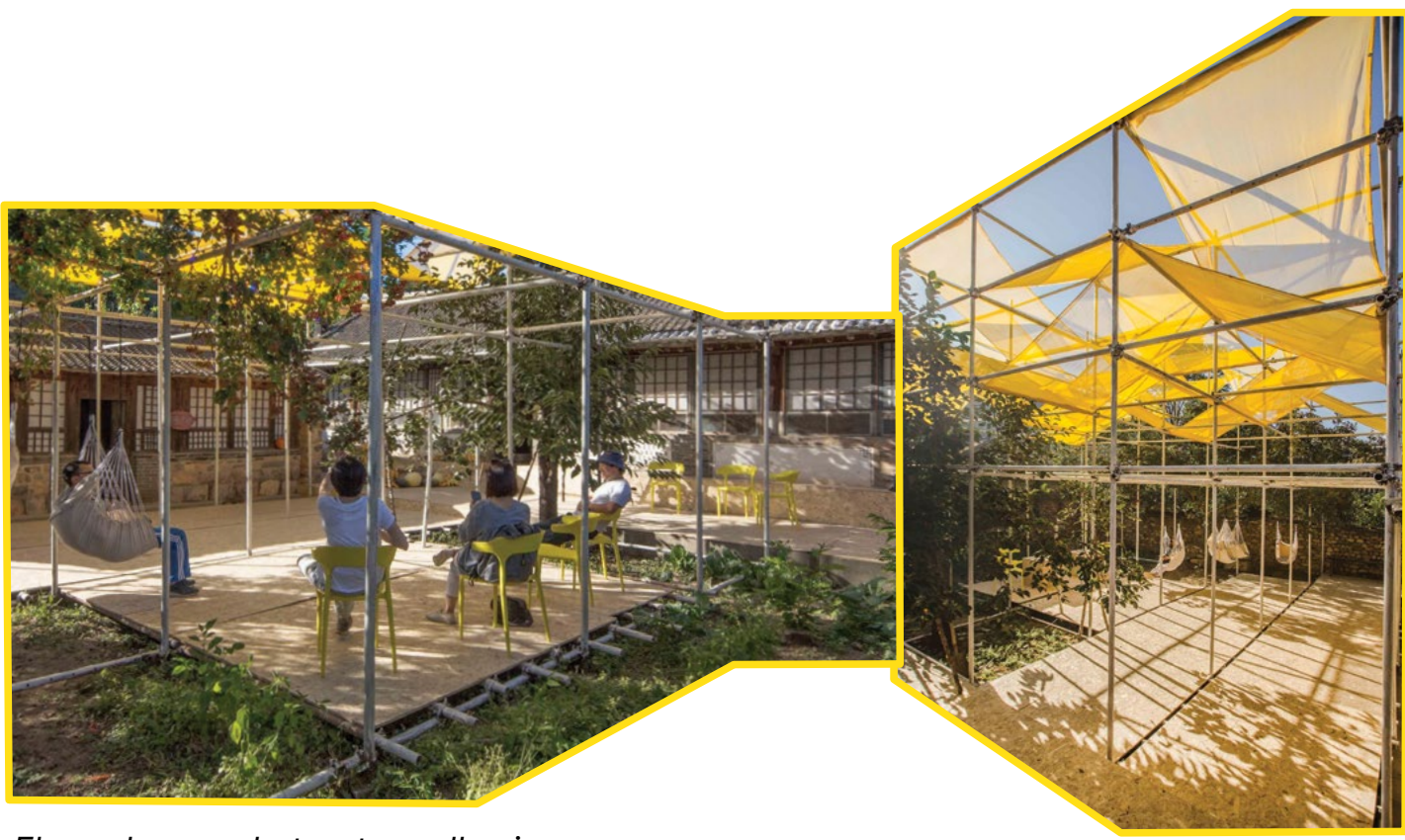
Floor above substructure allowing for a cleaner floor.