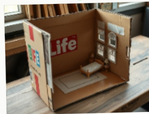
Cardboard Box Dollhouse Room