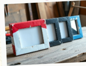
Cardboard Picture Frames