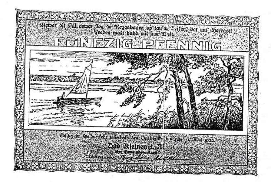
Bad Kleinen 50-Pfennig, Face, L-685 July 1999 -2-

Over the years, the area was occupied by armies of Denmark, Sweden, Austria and Russia.