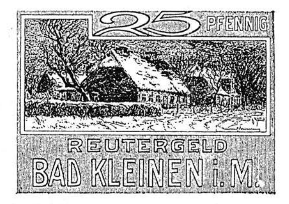
Bad Kleinen 25-Pfennig, Face, L-685 Bad Kleinen 25-Pfennig, Back, L-685

Effective April 1, 1992, the Gemeinde of Bad Kleinen encompassed the villages of Fichtenhusen, Gallentin, Hoppenrade, Losten, Niendorf, Wendisch Rambow and Glashagen.