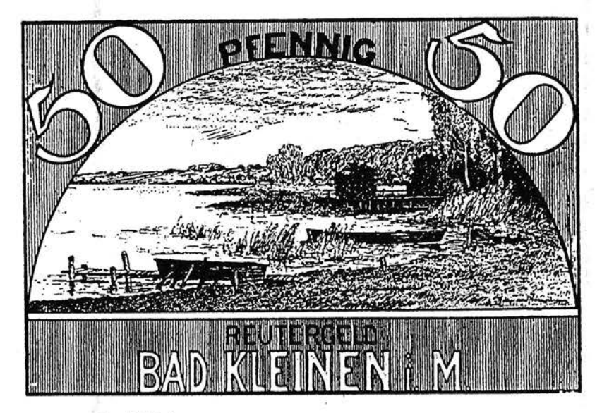
Bad Kleinen 50-Pfennig, Back, L-685

Reutergeld towns already covered in THE FRAKTUR are Heiligendamm/Bad Doberan, April 1991, and the tale of the disappearing morning coat from Kluetz, August 1998.