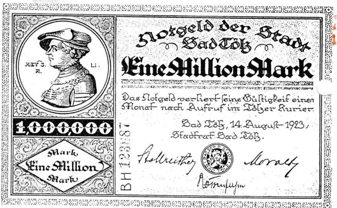
A 16th Century warrior poses on a million Mark note of Bad Toelz, Aug. 14, 1923. A rampant lion appears in the arms of the city. The back of the note, appearing below, shows a view of the town about 1700, with the spelling Töcltz.

There are four spa gardens, with the waters available for drinking and bathing; and the treatment facilities. Other treatments are available in Bad Heilbrunn, a mineral water spa; the health resorts of Bad Benediktbeuern and Jaschenau; and climatic health resorts of Kochel am See, Waldensee and Lengries.