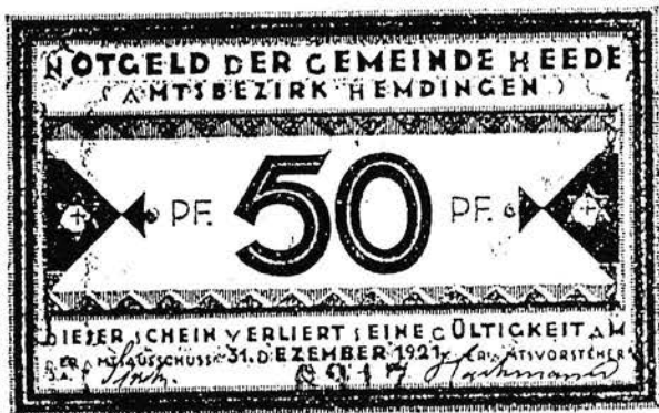
Heede, Amtsbezirk Hemdingen, issued a set of notes, L-568