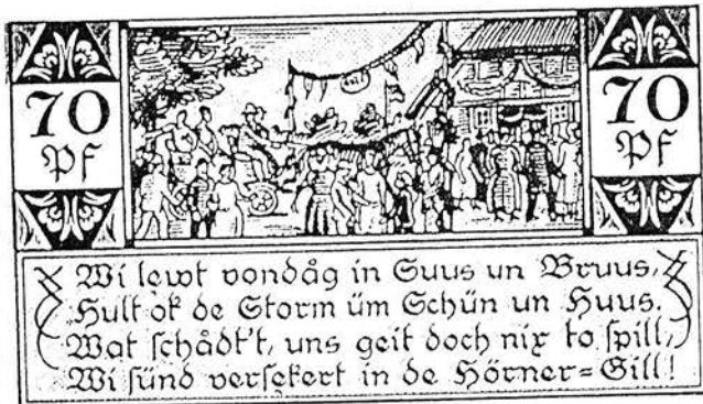
A horse-drawn wagon attends the county fair, as seen on the back of a 70-Pfennig notes of Westerhorn, L-1378

"If one can overlook the relative unattractiveness of this 'family' of Notgeld, the challenge to complete the series is rather formidable.