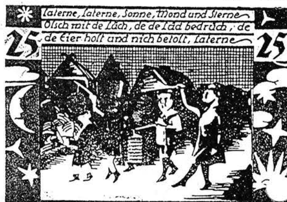
Lanterns help the local dance on a moonless night in Winzeldorf, 25-Pfennig, L-1399

And he concludes that after you have used the following list as a checklist and obtained all the notes, you can begin to collect the varieties in color, serial numbers and watermarks. Good hunting!