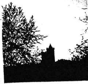
Silhouette of Burg Saaleck