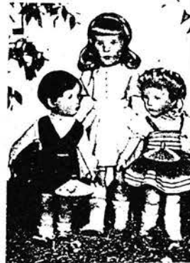
Examples of Kaethe Kruse Puppen from Bad Koesen, 1959.

Just downstream from Bad Koesen, also on the right bank, is the Kloster Pforta, founded in 1138 by Bishop Udo II of Naumburg. Today a remaining building is a museum.