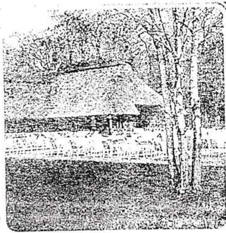
The old Ammerland farm house, with its thatched roof, is located in a park area today, maintained as a museum. Compare the modern view with the view on the back of the 50-Pfennig Notgeld piece, dating from the 1920 period.