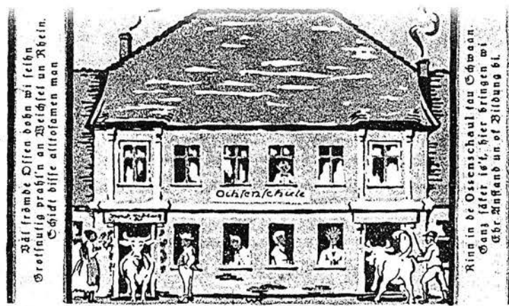
Children upstairs, oxen down, was the rule at the Ochsen Schule of Schwaan, above, 50-Pfennig, L-1173a. At left, back of the 10-Pfennig note of Guestrow showing the cathedral.

Two views of the castle can be seen on the 25- and 50-Pfennig Reutergeld notes of the city, 480A. Georg Schuetz designed the trio of notes. A view of the cathedral is seen from across a lake on the 10-Pfennig note.