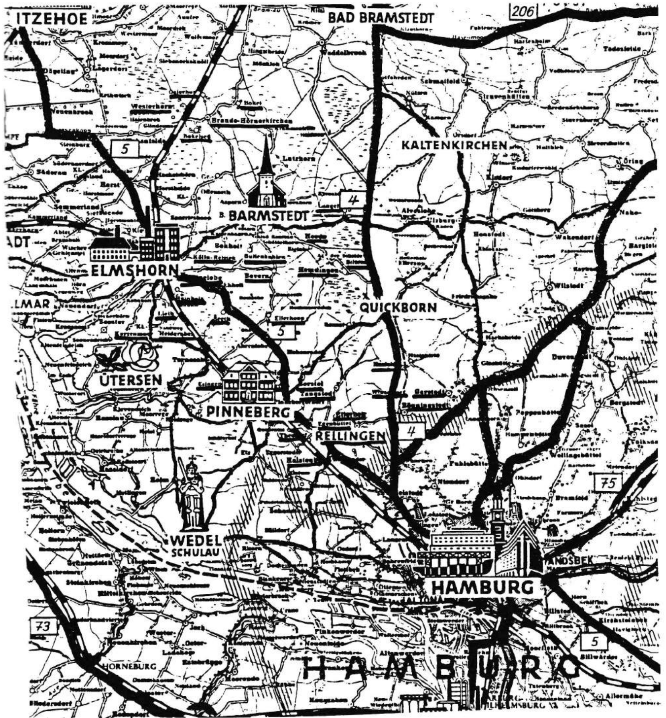
Map Showing Pinneberg District in Relation to Hamburg