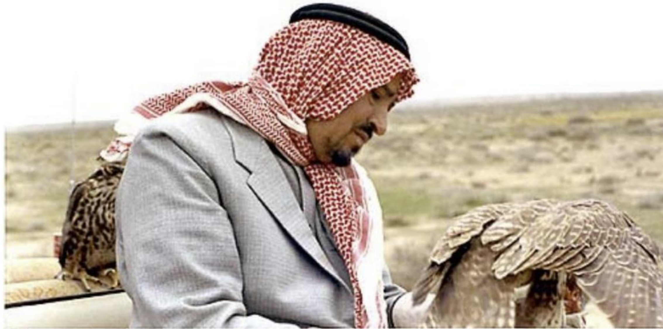
King Khalid ©