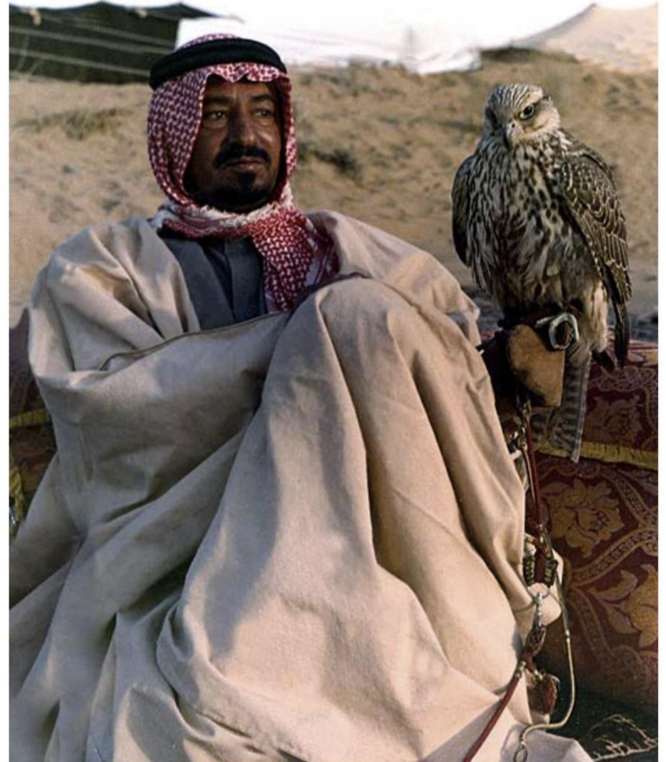
King Khalid

KKF's Warmth Campaign mentioned earlier had a slogan, "Together, let's make this winter warmer". Seeing what the Foundation has done so far and what it plans to do in the future, that simple phrase could be adjusted slightly to encompass KKF's ambitious and noble vision: "Together, let's make this country better."