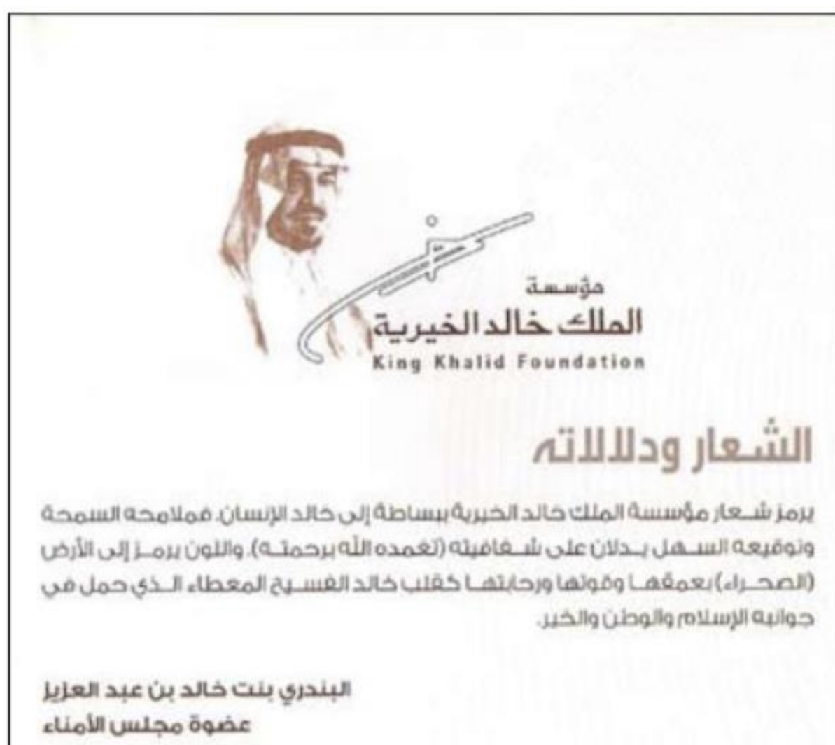
HRH Princess Banderi bint Khalid explains the King Khalid Foundation's logo.