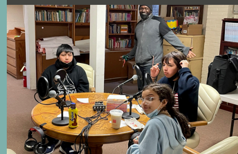
VOICES OF LONG ISLAND YOUTH (VOLIIY)