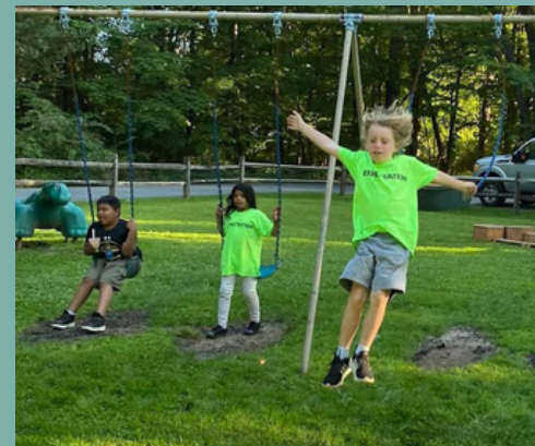
SUMMER OVERNIGHT LEADERSHIP CAMP