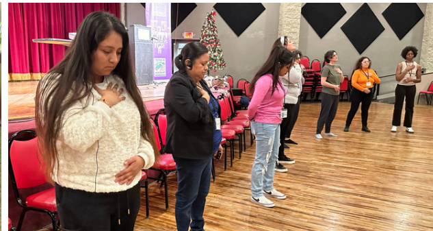
RURAL WOMEN'S ASSEMBLY