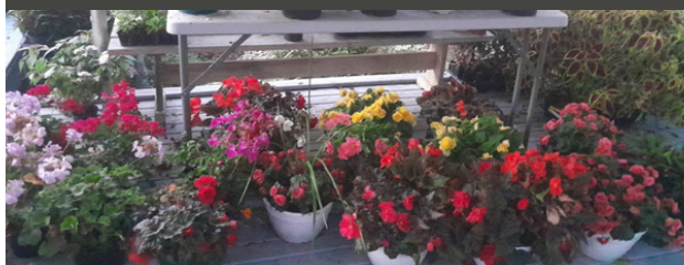
LONG ISLAND FARMWORKER COOPERATIVE