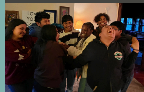
YOUTH ARTS GROUP (YAG)