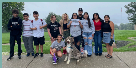
COLLEGE PREP PROGRAM