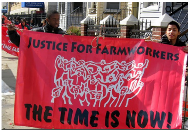
JUSTICE FOR FARMWORKERS