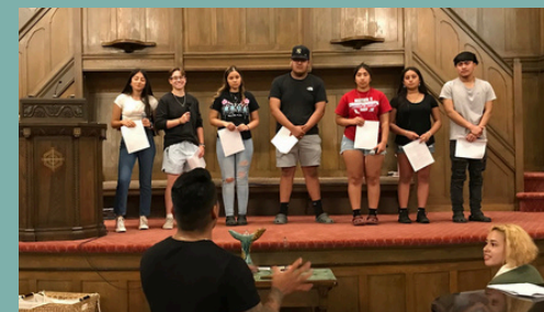
JUSTICE ORGANIZATION OF YOUTH (JOY)