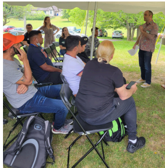
GATHERING FOR REFUGEES