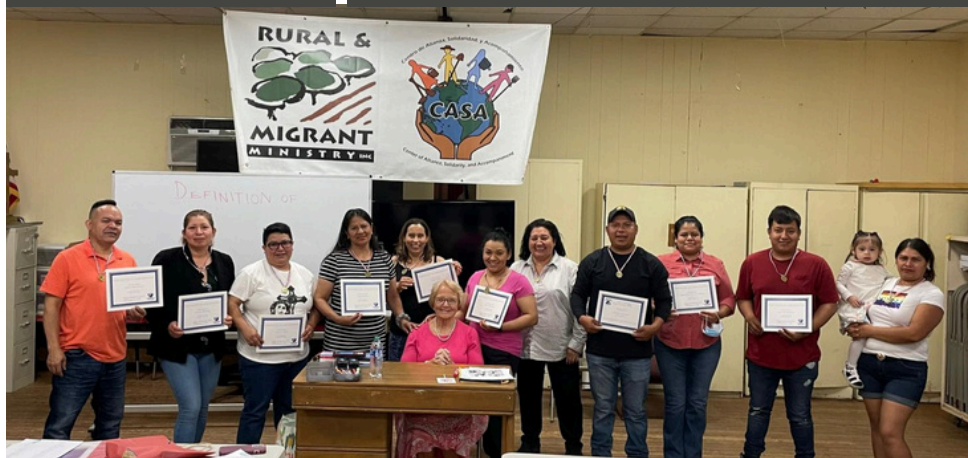
CENTER OF ALLIANCE, SOLIDARITY, AND ACCOMPANIMENT (CASA)