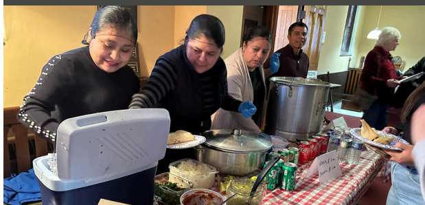
LAS CHEFS LATINAS COOPERATIVE