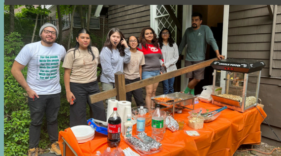
YOUTH ECONOMIC GROUP (YEG)