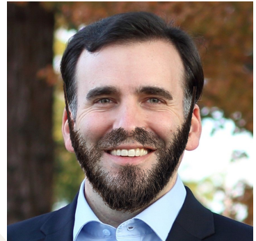
*Photoshopped beard for realism