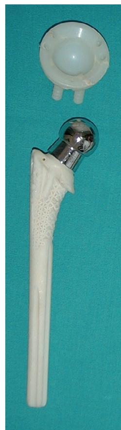
Figure 1. The acetabular and femoral components of the third-generation isoelastic RM total hip replacement.

For placement of the femoral component, a large pilot hole was made in the piriformis fossa to ensure correct alignment of the straight intramedullary drills used to prepare the femoral canal. In the next step, the canal was prepared with cylindrical and conical reamers in the diaphyseal and metaphyseal region, to fit the desired shape and size. Our goal was to use a femoral prosthesis that was large enough to contact both the medial and the lateral endosteal cortex of the femoral canal at the femoral isthmus, as determined by the templates (Pisot 1993). The prosthesis was fixed with press-fit in the prepared bone bed. Further fixation was obtained by two lag screws inserted through its proximal part to distribute the tension forces from the prosthesis to the trochanteric bone. Fem-