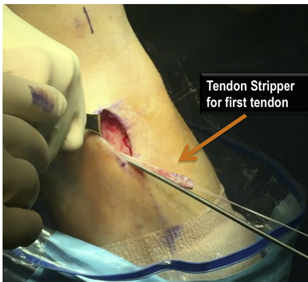
Fig 5. Intraoperative photograph (left leg) showing the use of the tendon stripper to harvest the gracilis tendon after whip-stitching the free end with a high-strength nonabsorbable suture (Ethicon).

The pes anserine insertion is in close proximity to the infrapatellar branch and sartorial branch of the saphenous nerve, and injury to these nerves have been reported as complications sustained during harvest. 7