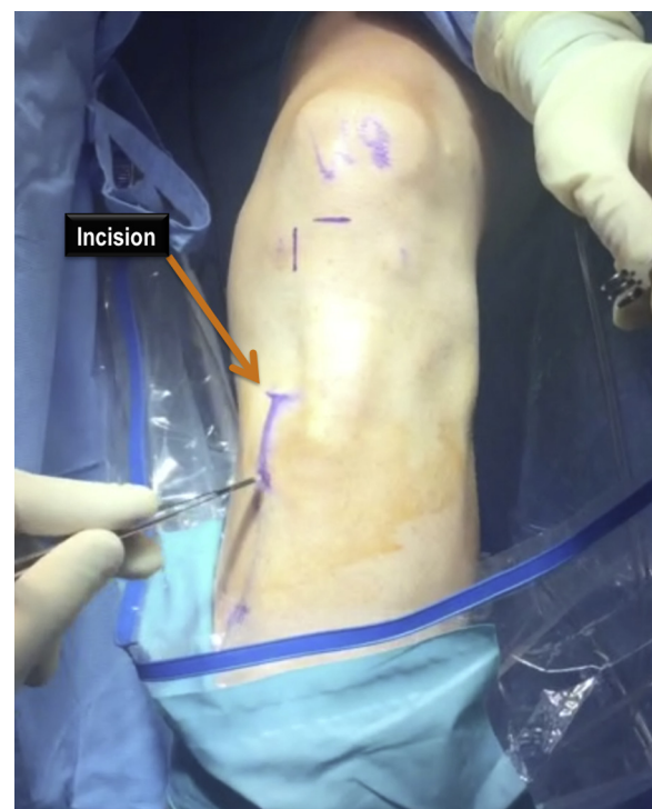
Fig 1. Intraoperative photograph (left leg) showing the location of the incision for semitendinosus and gracilis tendon harvest.

Osseous landmarks are drawn out , including the tibial tubercle, to aid in incision placement. The incision is placed along the pes anserinus (palpable) midway between the tibial tubercle and the posteromedial border of the tibia , and is approximately 2 to 3 cm in length ( Fig 1 ). The skin is incised with a no. 10 scalpel. The incision is carried through the subcutaneous tissue to the sartorial fascia with blunt dissection to the level of the sartorial fascia ( Fig 2 ). Care should be taken to avoid injury to the underlying superficial medial collateral ligament as well as to the infrapatellar and sartorial branches of the saphenous nerve. Injury to the medial collateral ligament can be avoided by visualizing this structure, and injury to the nerve branches can be avoided by using a knife for the skin incision only, followed by blunt dissection of the subcutaneous tissue down to the sartorial fascia. At this time, the rolled borders of the gracilis and semitendinosus tendons can usually be palpated with the pad of the surgeon's finger, just under the sartorial fascia. At the level of the pes, the gracilis tendon is located superior relative to the semitendinosus tendon, whereas the semitendinosus tendon has a bigger diameter compared to the gracilis tendon. A no. 15 scalpel is then used to make an "inverted L"-shaped incision in the sartorial fascia in