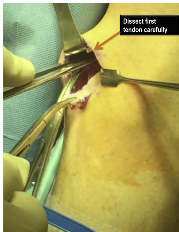
Fig 4. Intraoperative photograph (left leg) showing dissection of the gracilis from the sartorial fascia and from the semitendinosus, prior to harvesting.

The wound is then copiously irrigated and closed in layers in standard fashion. Postoperative restrictions are