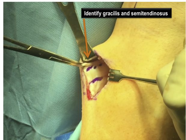
Fig 3. Intraoperative photograph (left leg) showing the location of the semitendinosus and gracilis tendons after dissection free from the sartorial fascia.

At the back table, the muscle tissue is cleared off of each tendon, and the remaining free ends of each tendon are whip stitched. The graft can ultimately be prepared using any one of a number of different techniques based on surgeon preference.