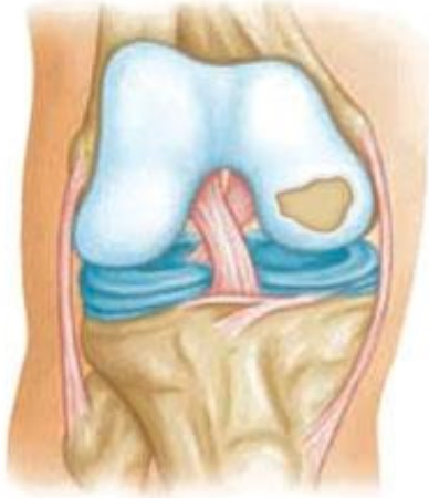
Articular cartilage in the knee damaged in a single, or focal, location.

The knee is the most common area for cartilage restoration. Ankle, shoulder, and elbow problems may also be treated.