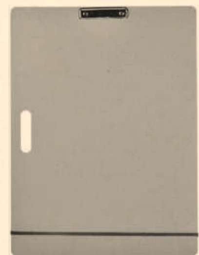
Sketch board 45x60cm/18x23"