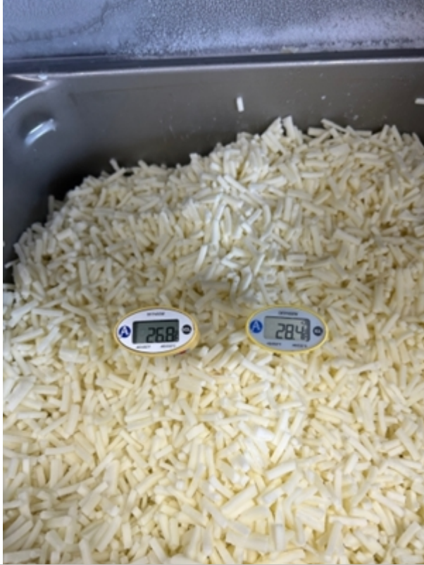
Recognition and Guidance