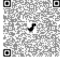
BUMP BAR CHEAT SHEET- DOCUMENT