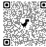
SLIDE METHOD PIZZA FLOW- DOCUMENT

*Pro Tip: Your line's slowest TM should be in the middle so that the quicker TMs are both pushing and pulling them to go faster.