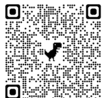
SLIDE METHOD, SIDE FLOW- DOCUMENT