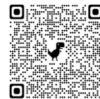
DIGITAL SHOULDER SURFING (DSS)- MACIPEDIA