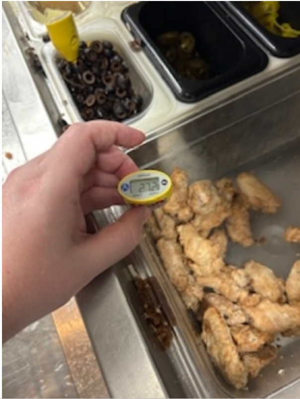
Recognition and Guidance