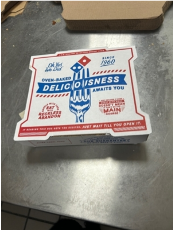
Product prepped for expected sales volume