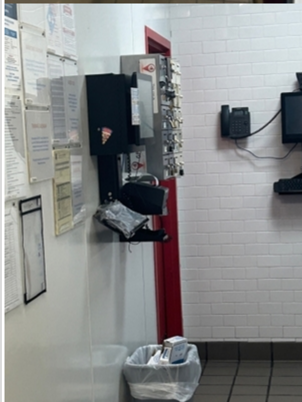
Recognition and Guidance