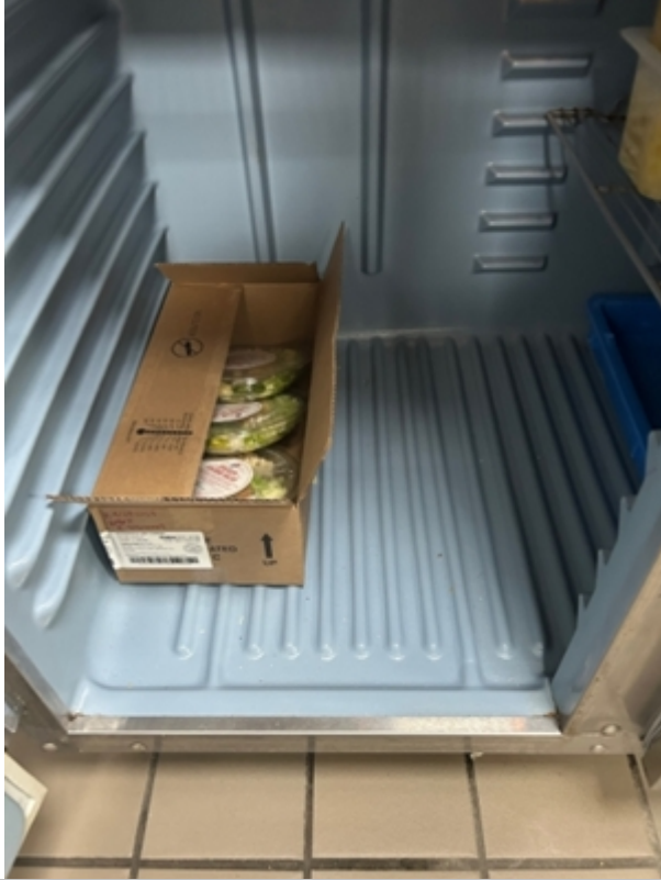
Recognition and Guidance